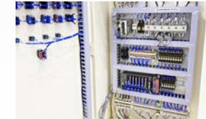
Control panel solution

Depending on specific customer needs, systems combine various IDEC products and collaborative robots that can work in the same workplace with humans.