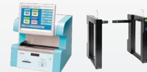
Library system solution