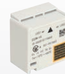
Explosion protection vibration sensors