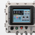
Explosion protection operator interfaces