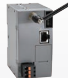
Cloud-based data logger