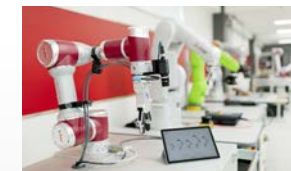
Robot system solution